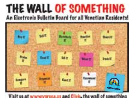
Visit us at www.vgrcca.us and Click the wall of something

...recommendations posted by our residents...all of them.... urologist, chiropractors, salons, saloons, roofers, estate attorneys, divorce attorneys, safe places to eat, pet sitters, upholsterers, transportation to Punta Gorda, opticians, travel agents, fortune tellers, genealogists, .....the list goes on and on. Join the love group by posting on www.vgrcca.us.wallofsomething .